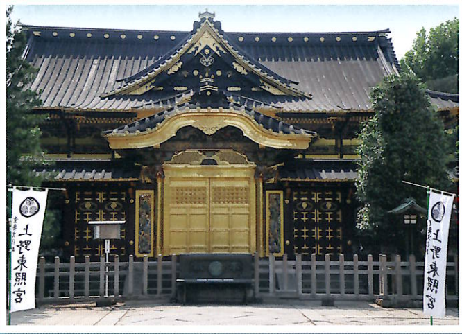
Ueno Toshogu Shrine

Come and discover the hidden charms of Ueno! Ueno Park was originally a temple to the family of the Tokugawa shoguns, but the area later became a battle field in the civil war of the nineteenth century, which resulted in the Meiji era and the dawn of Japan's westernization. In this tour you can visit ruins and other sites of the Edo period (the Tokugawa shogunate), the civil war, and the Meiji era.