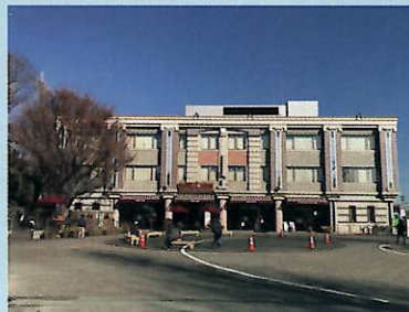
Ueno Green Salon