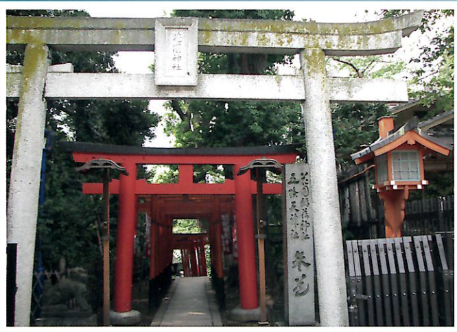
Hanazono Inari Shrine